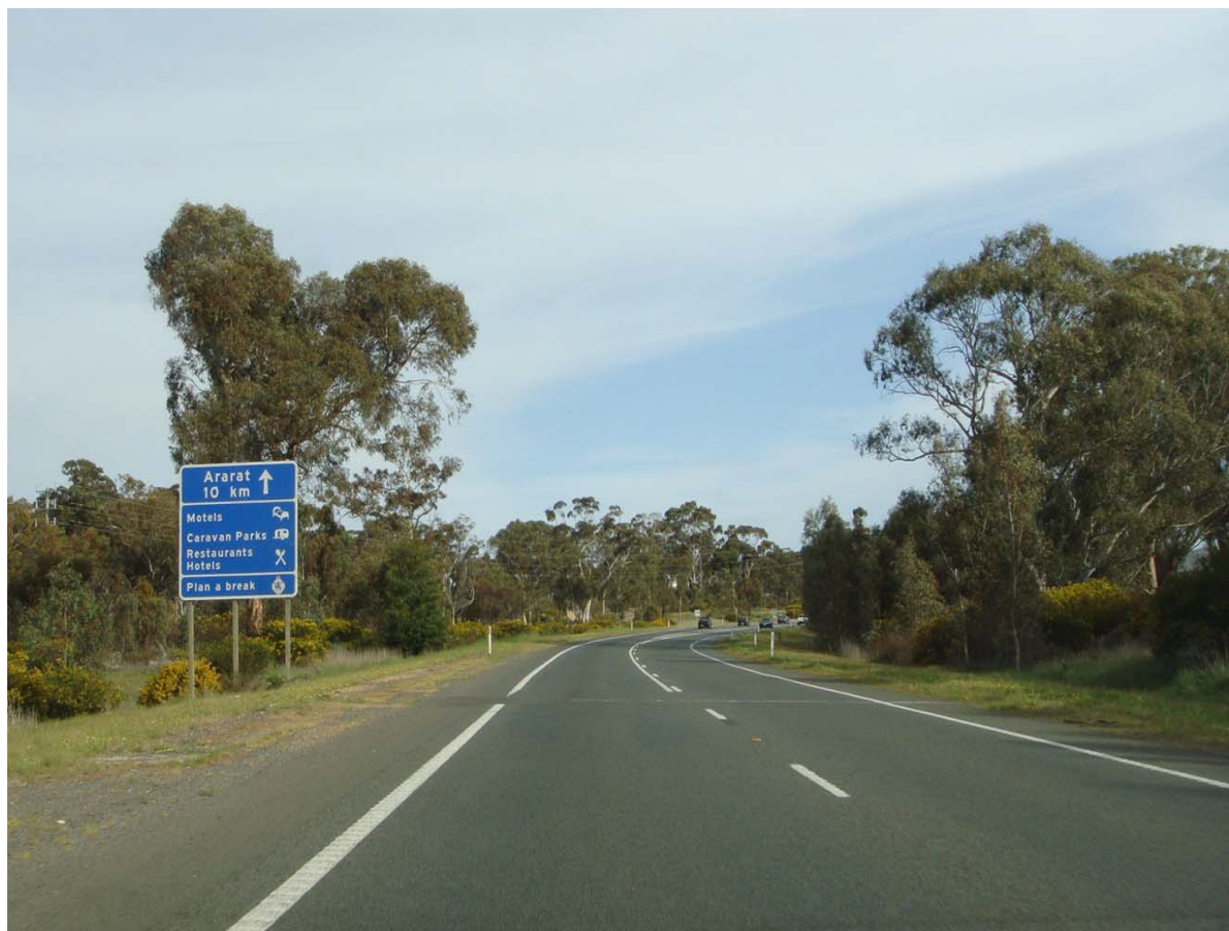
Western Highway – looking south towards Armstrong Deviation