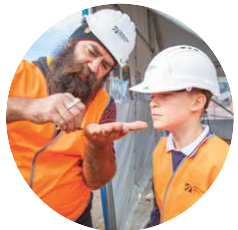
Images above: Drysdale students learning about the importance of the Cultural Heritage salvage process.

We will work alongside the Wadawurrung community in sharing the findings of the analysis as well as helping the Traditional Owners with repatriation of the artefacts.