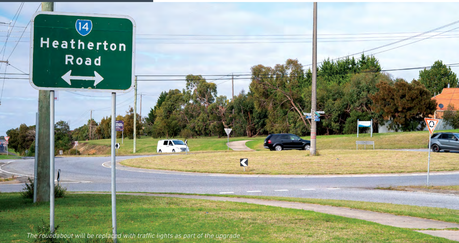
The roundabout will be replaced with traffic lights as part of the upgrade

This update is printed on 100% recycled paper.