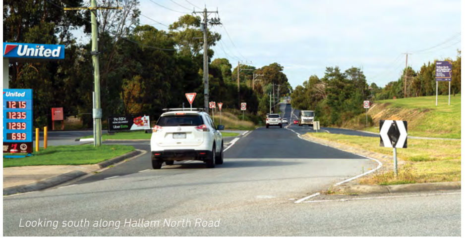
Looking south along Hallam North Road

Location: Endeavour Hills Shopping Centre, cnr Heatherton Road and Matthew Flinders Avenue, Endeavour Hills