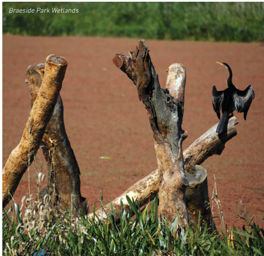
Braeside Park Wetlands