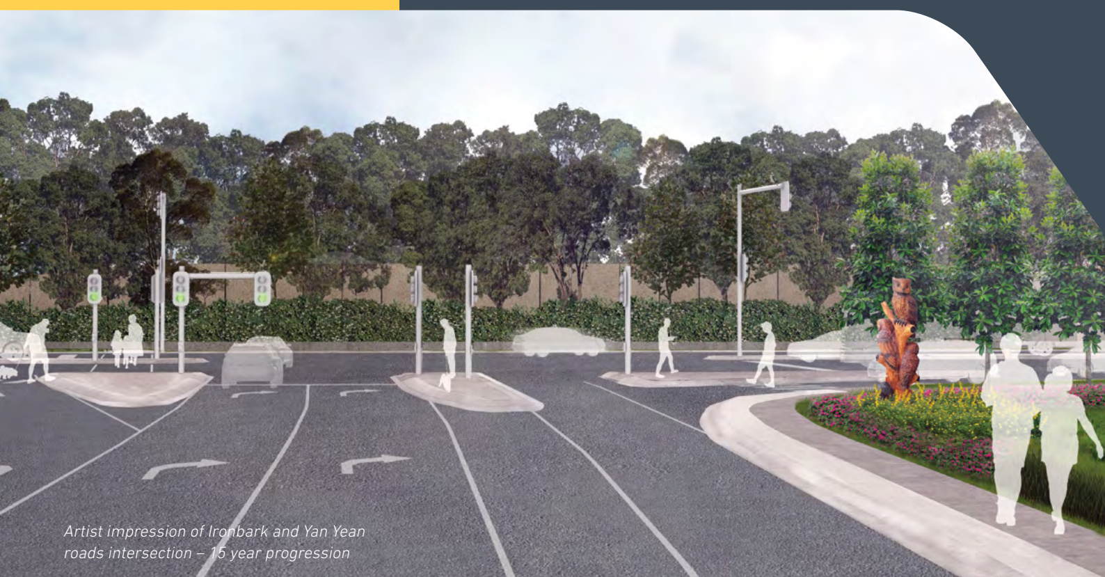
Artist impression of Ironbark and Yan Yean roads intersection – 15 year progression

We'll continue to update the community throughout the year and provide an update on the design and project timing when it's confirmed.