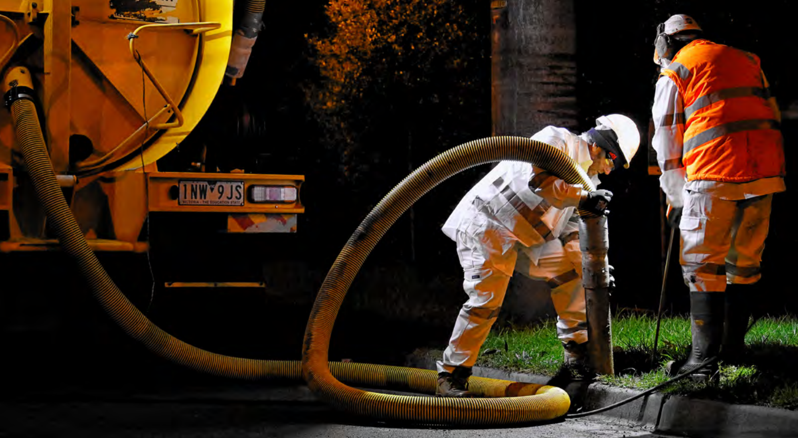
Service investigations will start from August