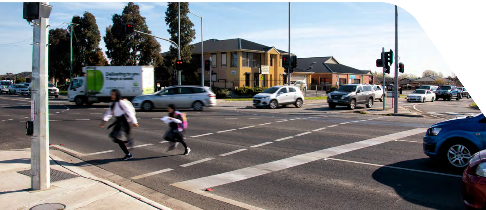
Image below: Pedestrians crossing Narre Warren-Cranbourne Road towards Spirit Boulevard

Strict COVIDsafe Plans are in place on all project sites across Victoria. For more information and advice about the coronavirus (COVID-19), please visit coronavirus.vic.gov.au