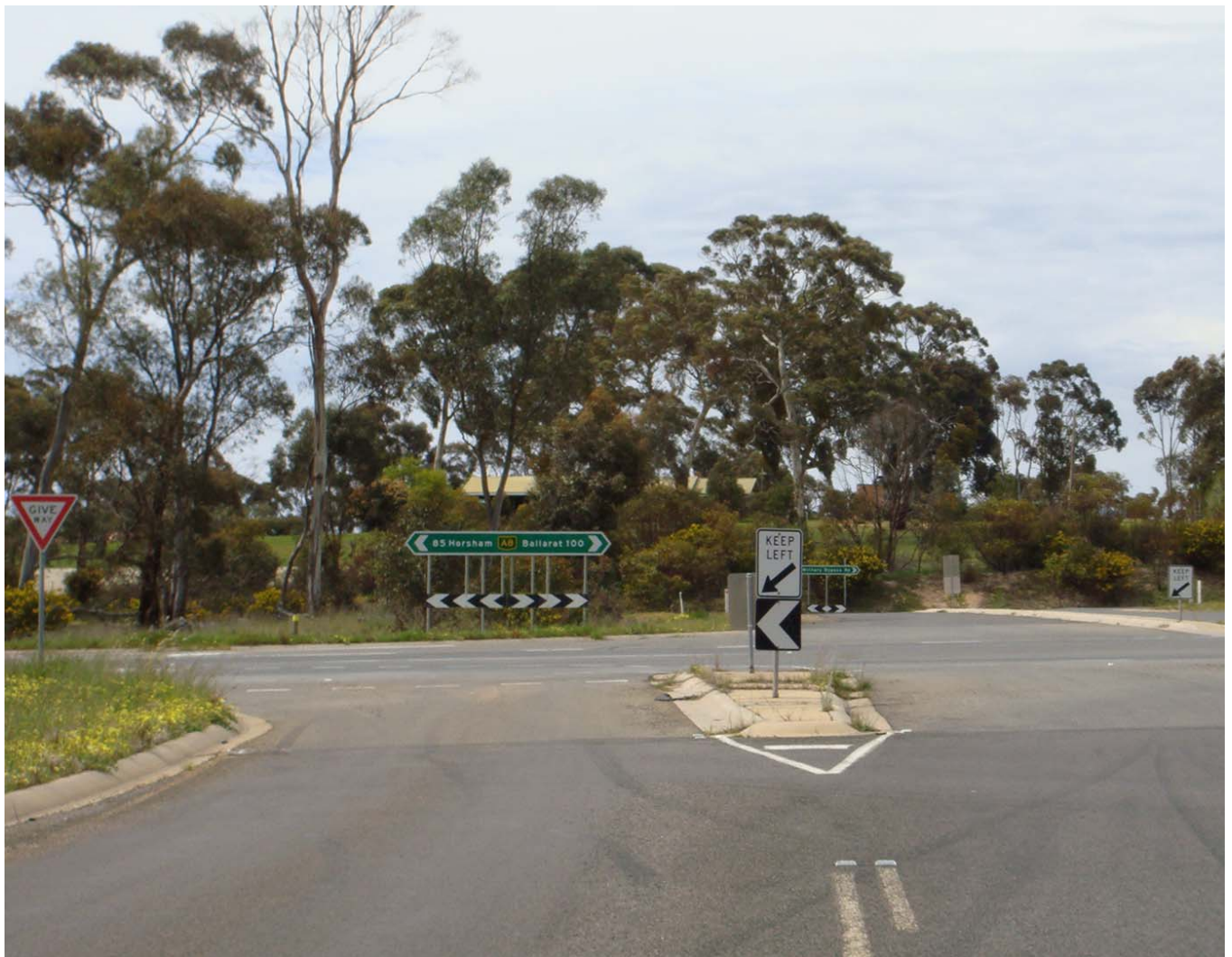
Intersection of Garden Gully Road and Western Highway

The construction of the Project would have short term impacts on the operation of the existing Western Highway, including reduced speed limits on some areas of the highway. Construction of the Project would be staged and traffic management plans would be implemented to reduce these impacts.