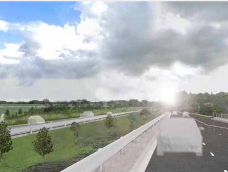
Artist's impression – 1 year progression