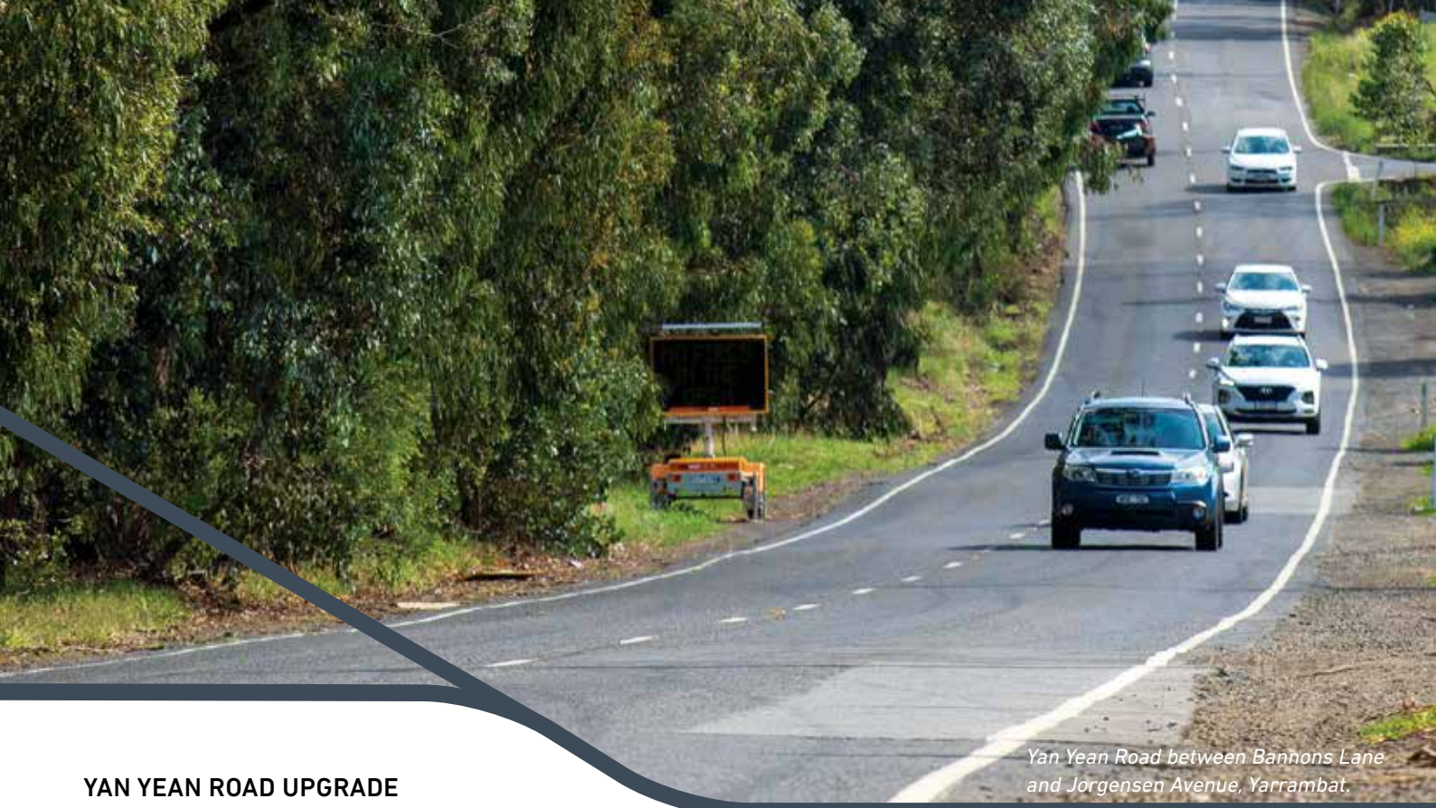
Yan Yean Road between Bannons Lane and Jorgensen Avenue, Yarrambat.