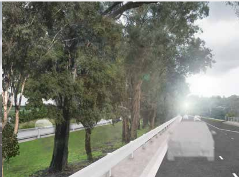
Artist's impression – 15 year progression