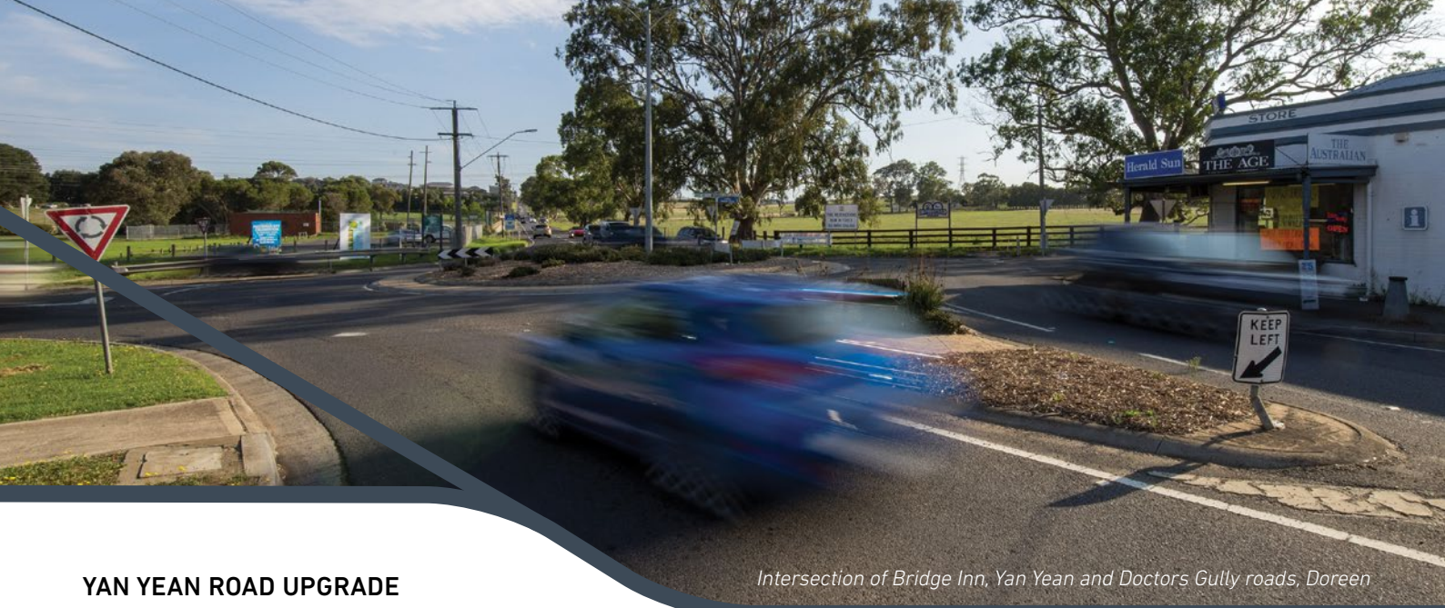
Intersection of Bridge Inn, Yan Yean and Doctors Gully roads, Doreen