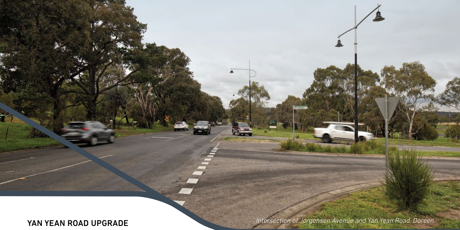
Intersection of Jorgensen Avenue and Yan Yean Road, Doreen