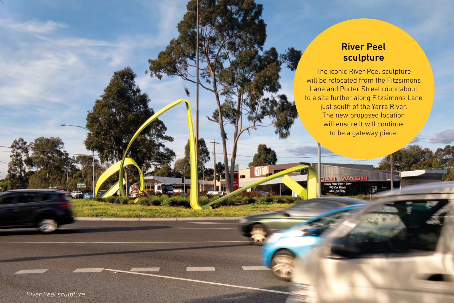
River Peel sculpture