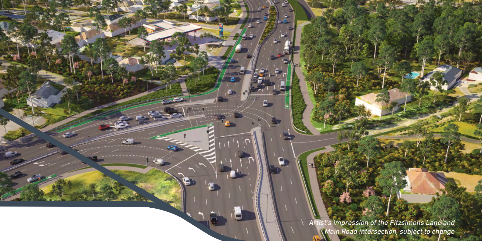
Artist's impression of the Fitzsimons Lane and Main Road intersection, subject to change