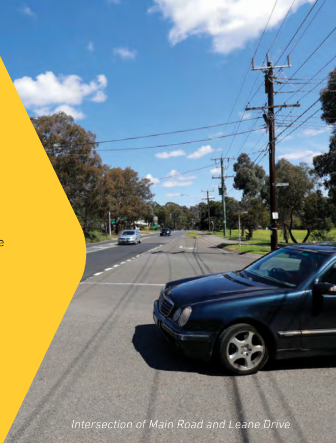
Intersection of Main Road and Leane Drive