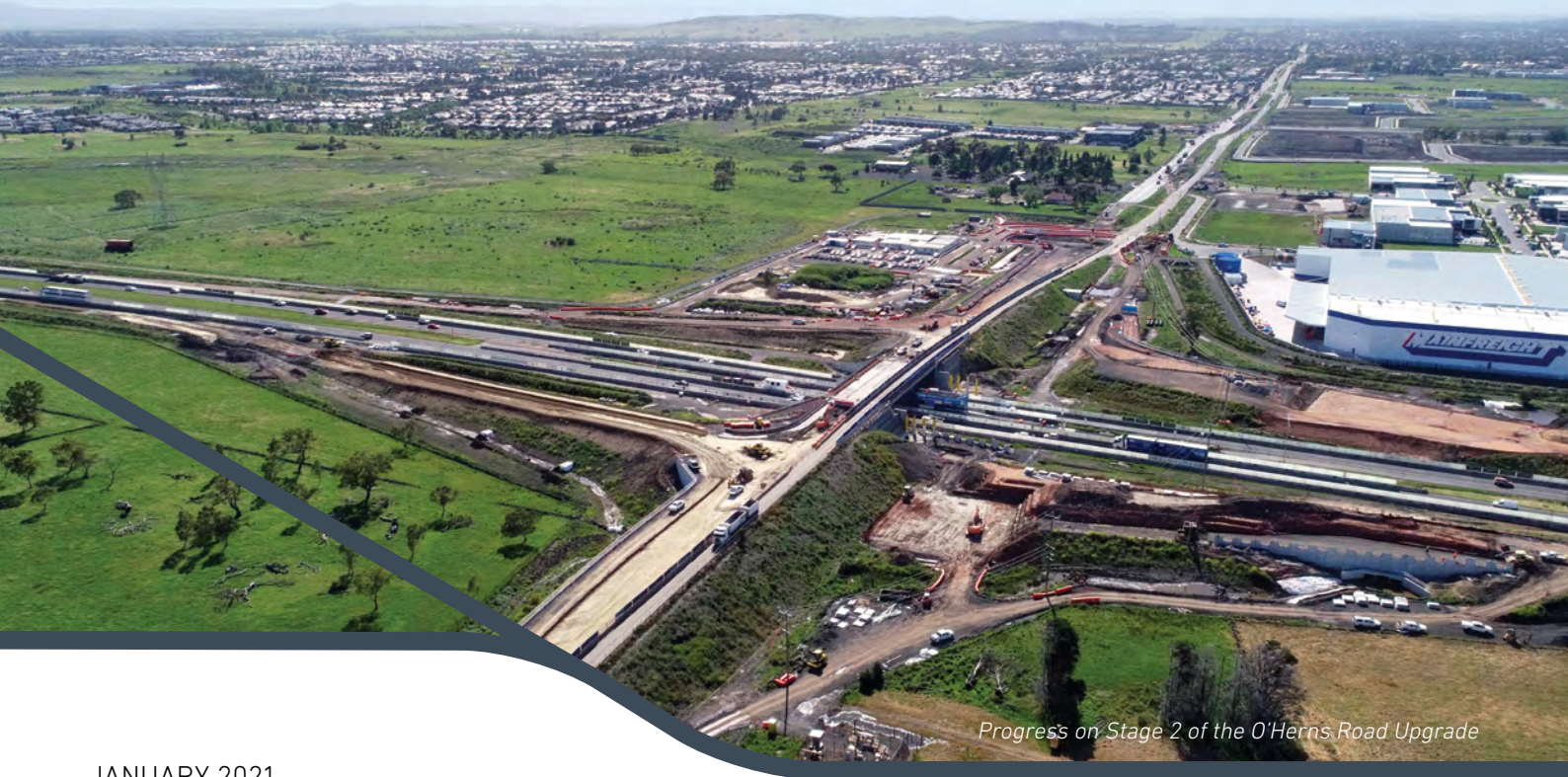
Progress on Stage 2 of the O'Herns Road Upgrade