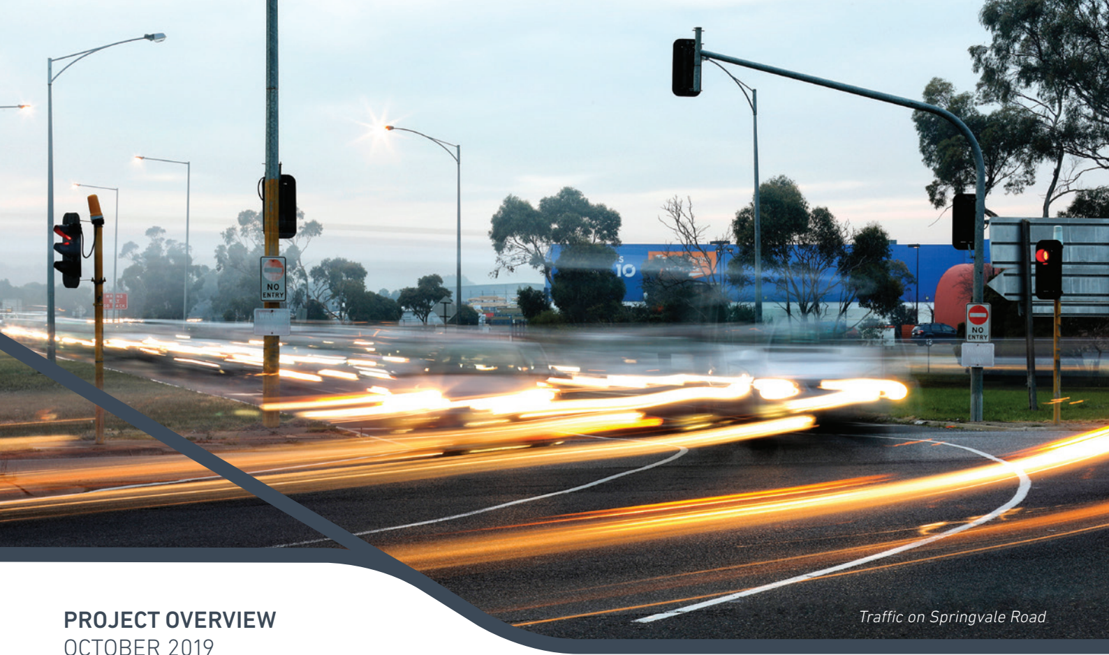
Traffic on Springvale Road