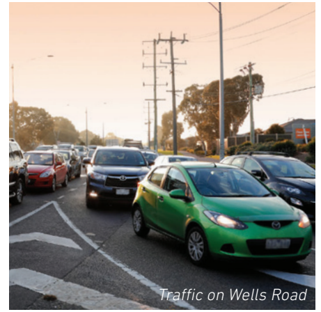
Traffic on Wells Road