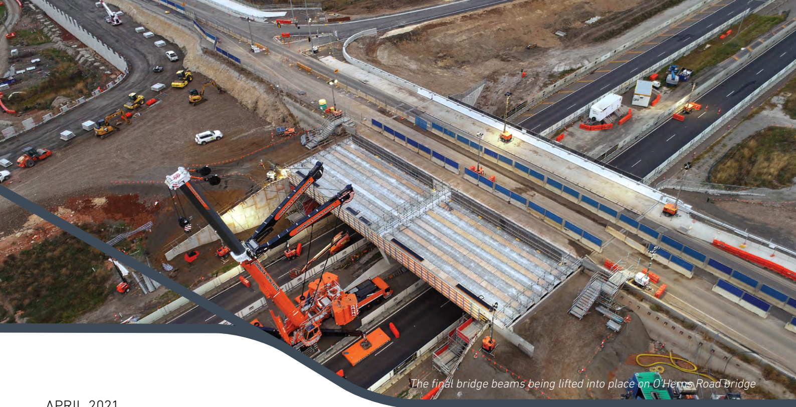
The final bridge beams being lifted into place on O'Herns Road bridge